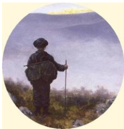
Painting: Theodor Kittelsen

Check out the summer sale for unlimited domestic flights in Norway: http://www.wideroe.no/explorenorway