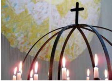
Norwegian Seaman’s Church