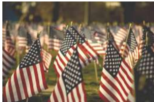
American Flags on Display on the National Mall

Honoring Those Who Gave Their Lives While Serving