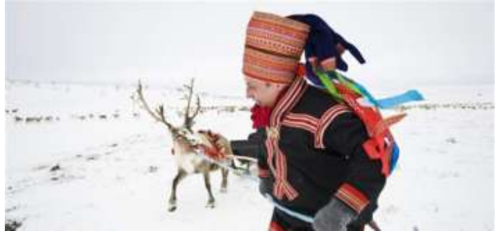
The population of Kautokeino is 3,000 people and 100,000 reindeer.

Sámi culture The next day I would travel to Karasjok and Kautokeino to get a taste of our unique Sámi culture."