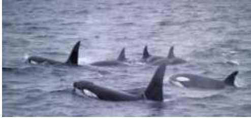
It is possible to swim with the orca whales from October to January in Tysfjord.

Norway has much to offer tourists in the winter: snow, mountains, fjords and the unique culture of the Sámi people. We invited Audun Pettersen, one of the people most actively involved in Norway's tourist industry, to tell us about some of the activities he would recommend.