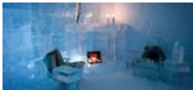
"I would start by flying to Alta and spending the night at the Igloo Hotel. It will be an experience you will not soon forget, and it is not actually as cold as you might think, considering that the entire hotel is made of ice. There is a special kind of stillness there due to the snow and ice, and I had an unbelievably good night's sleep when I stayed there."

Sámi culture The next day I would travel to Karasjok and Kautokeino to get a taste of our unique Sámi culture."