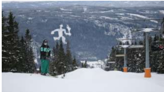
Hafjell og Kvitfjell i Gudbrandsdalen i Norge. Site of skiing events for OL 1994 (Olympics Lillehammer 1994). Notice the “man on the far mountain”!

The gift of Sons of Norway Membership is a passport that opens doors to history, language, rich Nordic culture, artisan crafts and much more! Every month your gift will bring the Viking magazine to the home of the new member and an invitation to a local lodge event. Please chat with any Lodge Officer to give an awesome gift for Valentine's Day, a birthday or an anniversary.