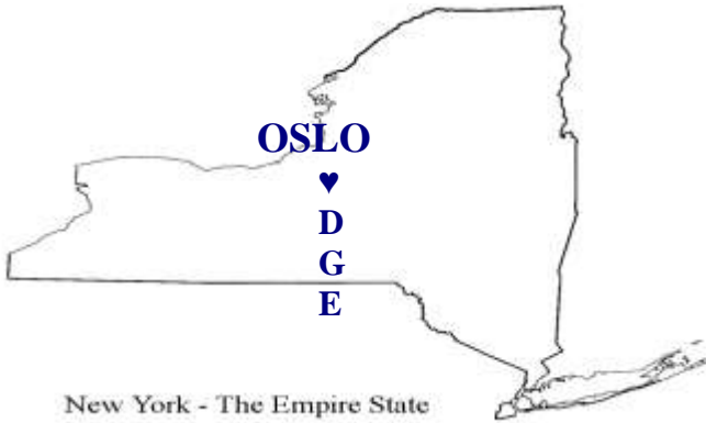
New York - The Empire State

“The mission of Oslo Lodge, Sons of Norway 3-438, is to promote and preserve the heritage and culture of Norway and other Nordic Countries.”