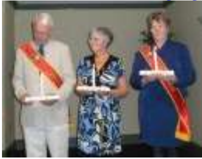
2010 3D Memorial Service